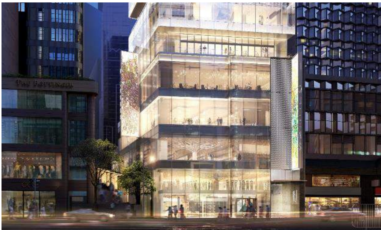
Rendering image of H Queen's building