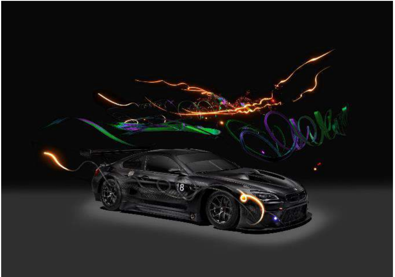
BMW Art Car #18 by Cao Fei Augmented Reality still (detail). BMW Art Car based on the BMW M6 GT3. © BMW AG and Cao Fei Studio