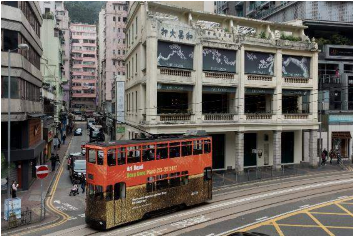
Art Basel in Hong Kong 2017 General Impression

FOR ALL ENQUIRIES, RSVPS AND INTERVIEW REQUESTS PLEASE CONTACT: HONGKONG@SUTTONPR.COM