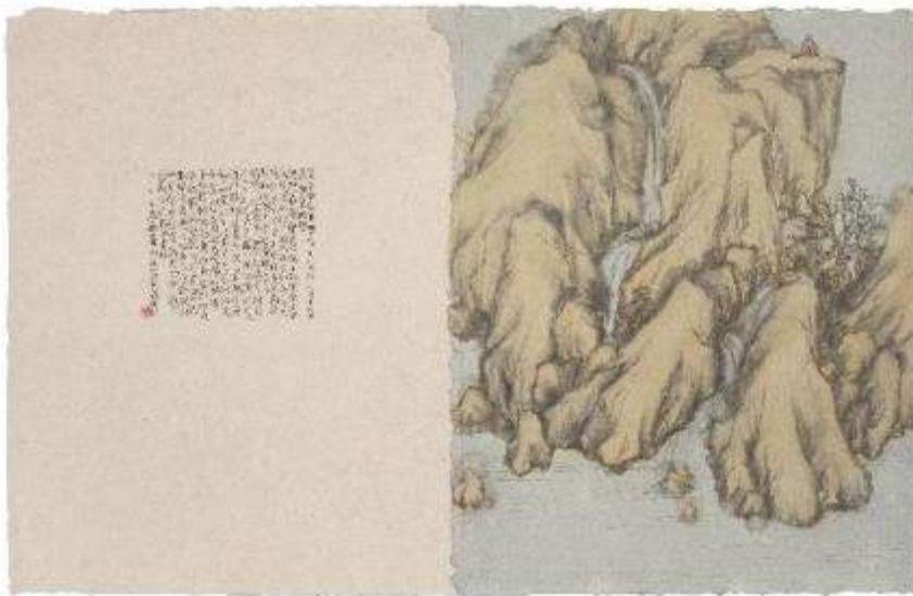
From L-R:; Laurent Martin 'Lo', Typhoon , 2017, weathered bamboo, titan braid thread, leads and ceramic ball, 225 x 210 x 125 cm, 260 cm rotation diameter. Image courtesy of Puerta Roja; Peng Wei, Migrations of Memory No 4 , 2017. Image courtesy of Galerie Ora-Ora