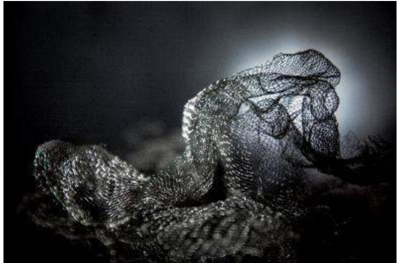
From L-R: Juri Markkula, Green to Lilac , interference pigment polyurethan and MDF board, 2015, 150x150cm. Image courtesy of Galerie Ora-Ora; Wu Chi-Tsung, Wire V , dimension variable, metal, acrylic, motor HID, 2017. Courtesy of Galerie du Monde