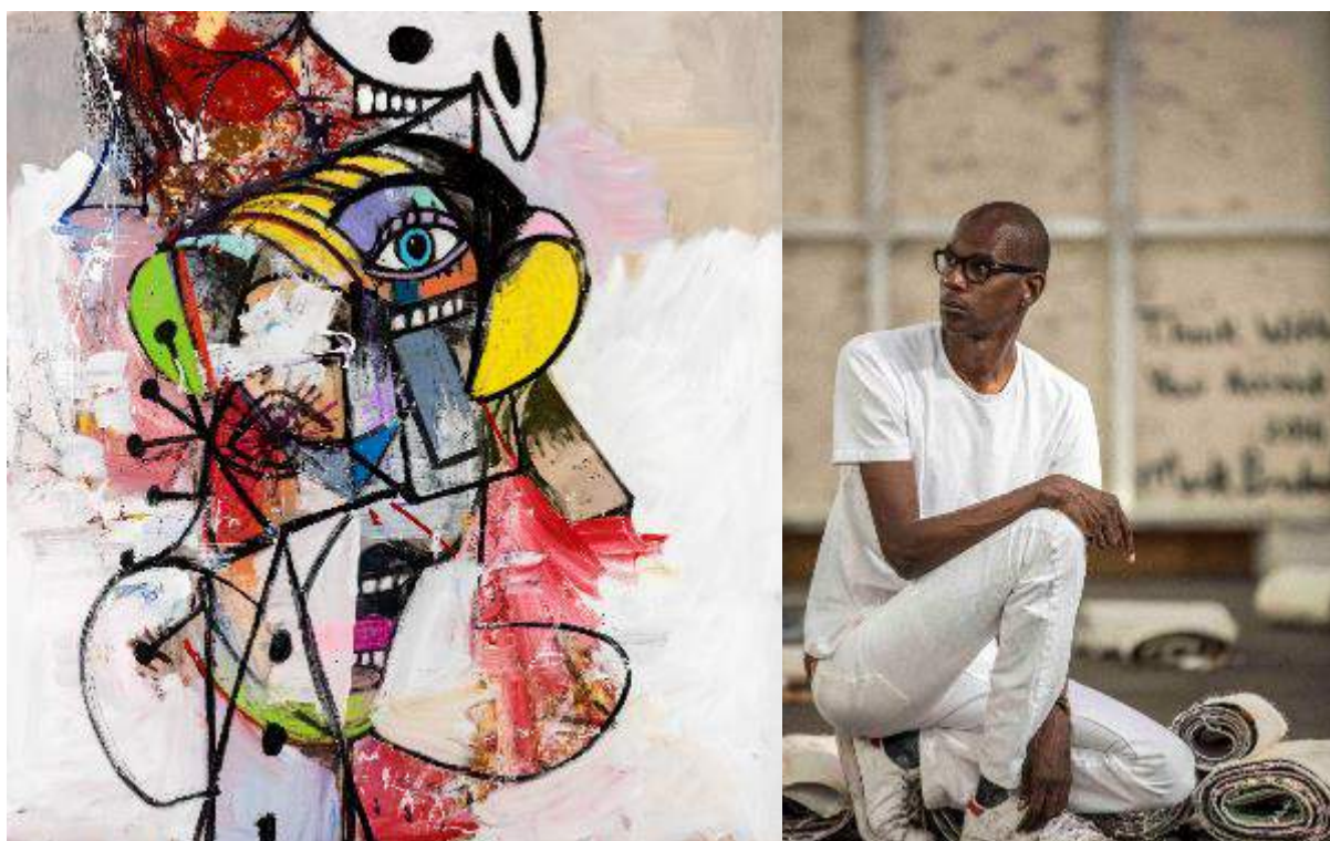
From L-R: George Condo, Laughing and Screaming, 2017 , acrylic, metallic paint, pigment stick, charcoal and pastel on linen, 80 x 74 inches, 203 x 188 cm © George Condo / ARS (Artists Rights Society), New York, 2017; Mark Bradford Portrait4 , Mark Bradford Portrait © Mark Bradford. Courtesy the artist and Hauser & Wirth