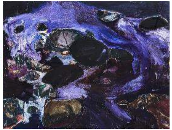
From L-R: Cristina Moroño, Oriente 3 , 2017, acrylic, oil, collage and bamboo paper pulp on canvas, 150 x 150 cm. Image courtesy of Puerta Roja; Ventoso, Dcd , 2015, assemblage high density polymer, diameter: 121 cm. Image courtesy of Puerta Roja; Xu Hongxiang, Beautiful Landscape NO.7 , 2017, oil on canvas, 200x260cm © Xu Hongxiang and Triumph Gallery. Courtesy of Gallery Weekend Beijing