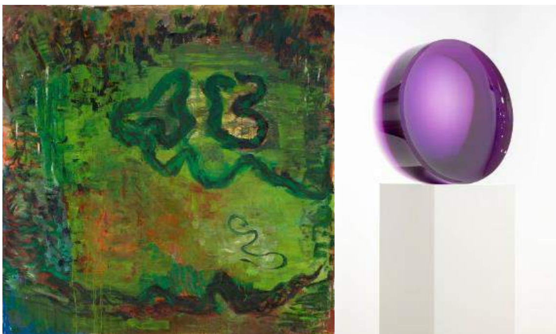
From L-R: Per Kirkeby, Mayalandet 2, 2011, oil on canvas, 78 3/4 x 78 3/4 inches, 200 x 200 cm, PK 1297. Copyright the artist, courtesy Michael Werner Gallery, New York and London; DeWain Valentine, Concave Circle, Purple, 1968-2016, cast polyester resin 74.3 x 74.3 x 37.2cm.

For more than five decades Michael Werner Gallery has remained committed to fostering the careers of some of the most dynamic artists of the 20th century, including A.R. Penck (whose first major posthumous retrospective opened at Shanghai's Fosun Foundation last year), Marcel Broodthaers, James Lee Byars, Enrico David, Peter Doig, Jörg Immendorff, Per Kirkeby, Markus Lüpertz, Sigmar Polke and Peter Saul. The gallery will present a selection of important highlights at the fair this year.