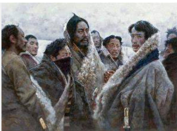
From L-R: Jennifer Guidi, Title TBD , 2018, sand, acrylic and oil on linen, 76 x 76 x 76 inches, (193 x 193 x 193cm) © Jennifer Guidi; 'Warriors', oil on canvas, 130 x 95cm